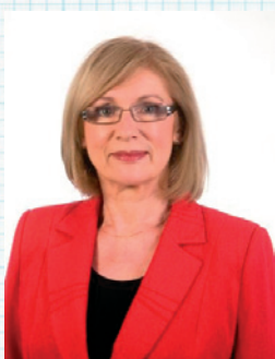
Jan O'Sullivan TD Minister for Education and Skills