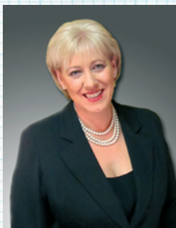
Heather Humphreys TD Minister for Arts Heritage and the Gaeltacht

We are delighted that Cavan and Monaghan Education and Training Board, through the establishment and development of a proactive Local Arts in Education Partnership (LAEP), is actively responding to the Charter's objectives. As Ministers with responsibilities for education and the arts we welcome this timely initiative and wish your partnership well in all its endeavours.