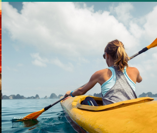
Outdoor Activity Instructor