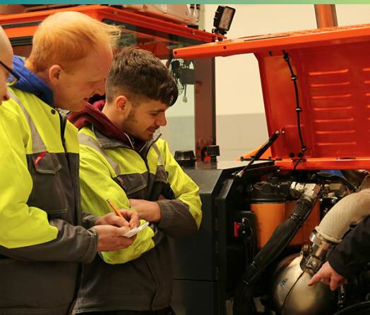
OEM Engineering Technology