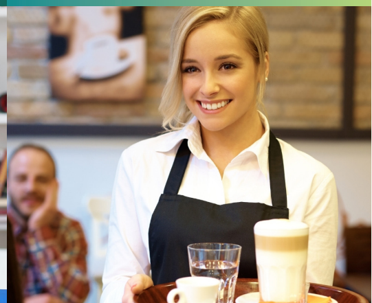
Specialist Skills Training