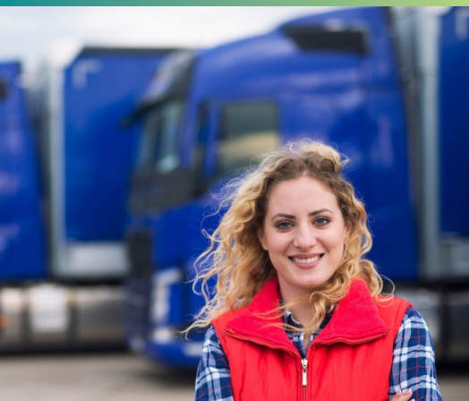
HGV Professional Driver