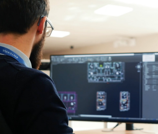
Advanced Certificate in Building Design using 3D CAD